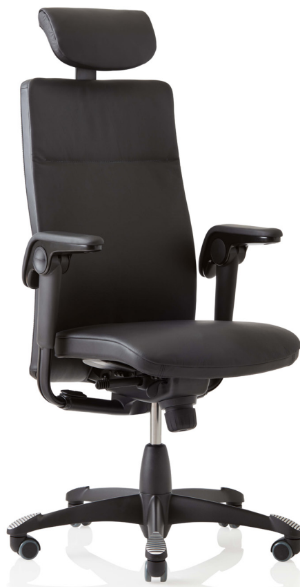
Design: Svein Asbjørnsen/sapDesign®. Patent- and design protected.