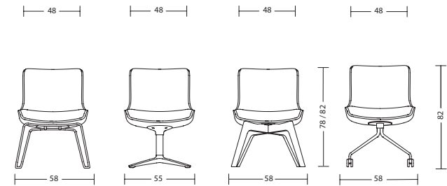
woo56 + 3246 / 3231 / 3206 / 3226 without arm supports: 7 kg